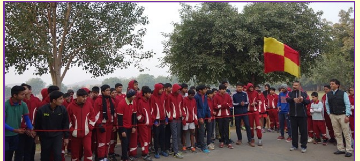
GET SET GO!