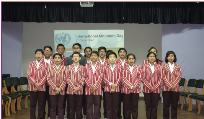
PROMOTING THE CAUSE...

A presentation was shown on the importance of mountains to life, to highlight the opportunities in mountain development. In relation to this year’s theme-‘Promoting Mountain Products’ a video on manufacturing of packaged tea was viewed by the students.