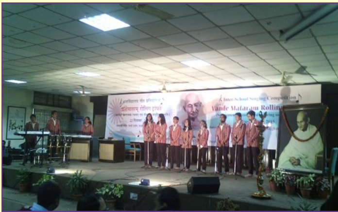
MELODIES FROM HEART