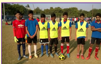
GEARED UP@SHIVAJI COLLEGE-NEW DELHI

It was an honour to represent my School in the first ever