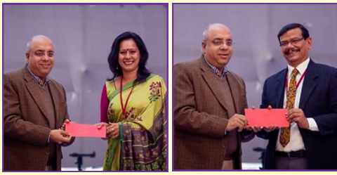
AWARD OF EXCELLENCE .....