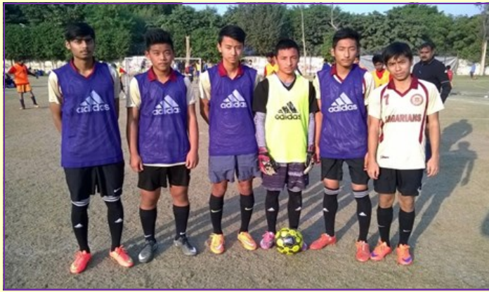
GEARED UP@SHIVAJI COLLEGE-NEW DELHI