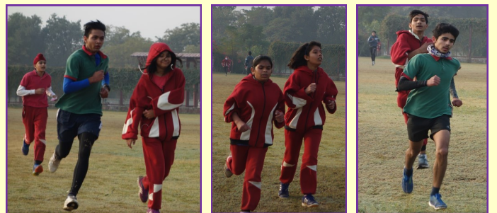
RACE TOWARDS EXCELLENCE