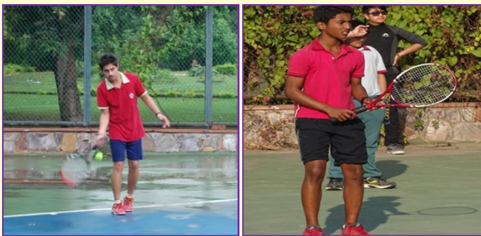
HIT THE BALL

The championship was won by Sapphire house.